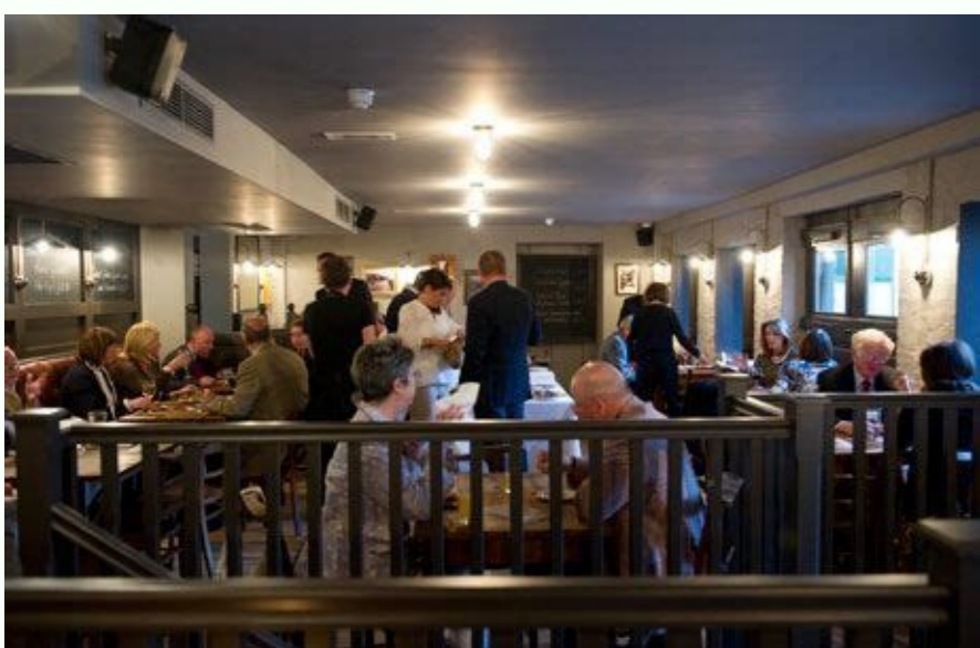
Newcastle good food plan. Newcastle food guide. Newcastle foodie guide. Restaurant guide newcastle.